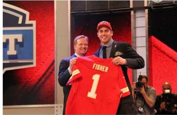
NFL's 2013 #1 Draft Pick, CMU's Eric Fisher of the Kansas City Chiefs will serve as this year's Homecoming Grand Marshal

We will have plenty of coffee, cider & doughnuts for all and with a hard stop at 11:15 a.m. we can rejoin the Actives and families out front to watch the Homecoming parade pass by as it heads north to downtown Mount Pleasant.